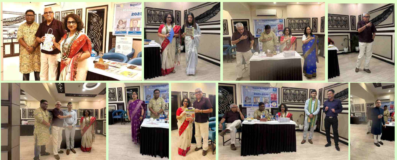
Photos of 535th Regular Meeting