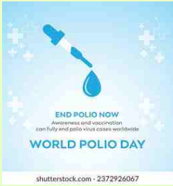
Club Cohosted the District Polio Day observation