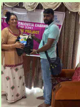
Monthly support to Special Children Home Pratham Padakshep