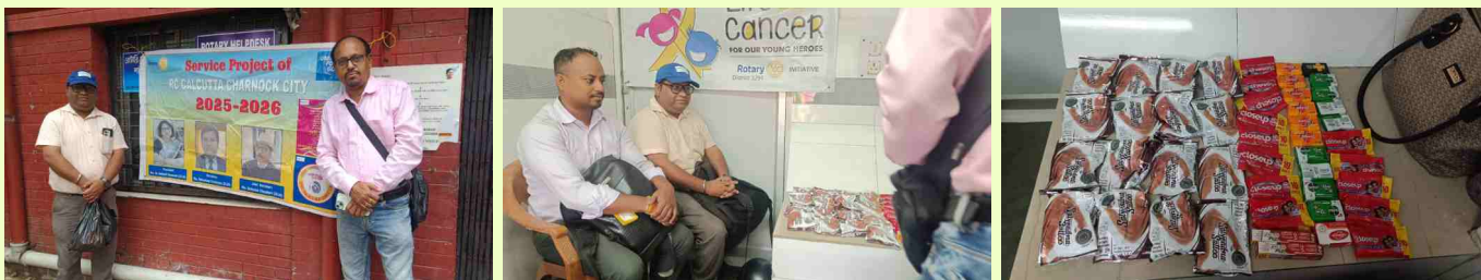
Monthly project at SSKM on 16th October