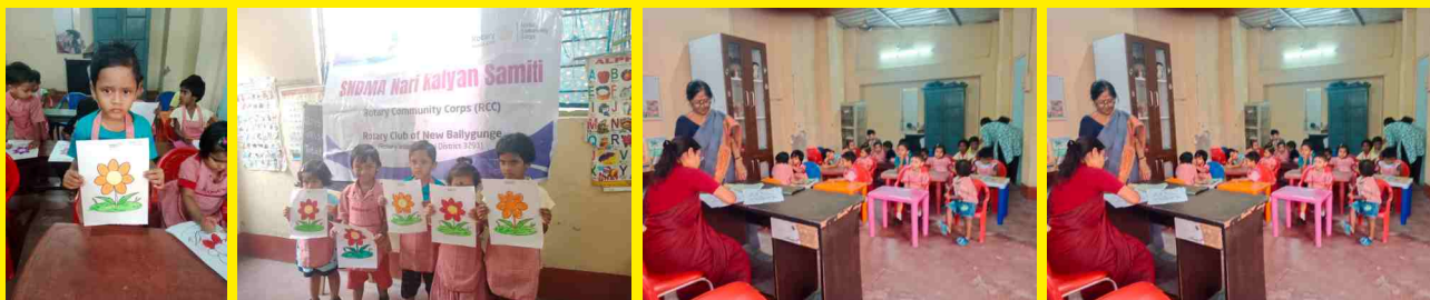
RC New Ballygunge celebrated advance Children's day with The students of Rainbow school of their RCC SNDMA Nari Kalyan Samiti. Children are 3 years old. RCNB arranged Art workshop with these children.