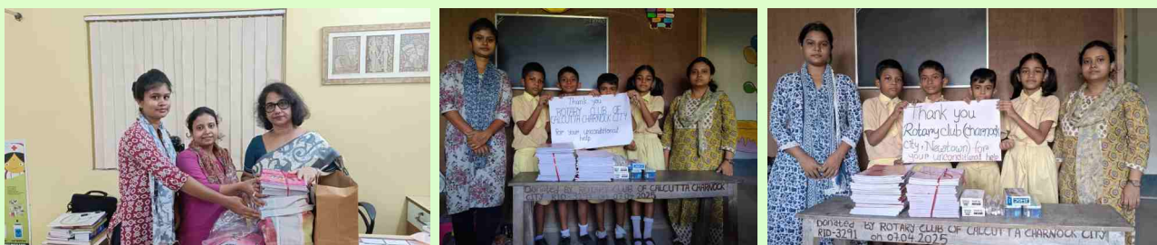
Monthly Literacy support project at Swapna Choya Model School